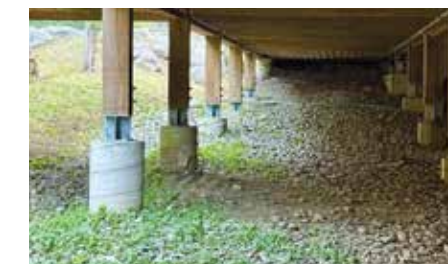
CHECK YOUR DECK

Cut grass short and prune low branches or branches hanging over your home. This helps reduce the chance of fire climbing upward and spreading.