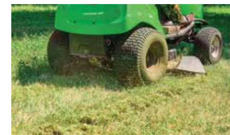
KEEP IT SHORT

Cut grass short and prune low branches or branches hanging over your home. This helps reduce the chance of fire climbing upward and spreading.