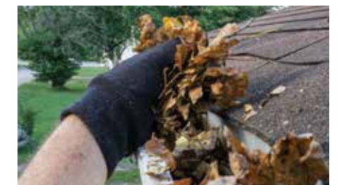
CLEAR LEAVES FROM EAVES

Remove dead leaves and avoid storing patio furniture or firewood under your deck. These materials can easily catch fire from embers and that fire spreads to the home.